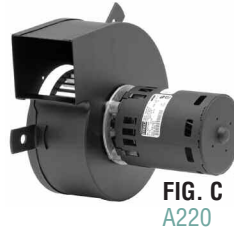
FIG. C A220