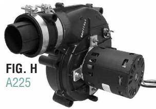
FIG. H A225