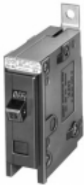
QUICKLAG Type BA 1-Pole