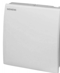
QPA20... Series Room Air Quality Sensor.