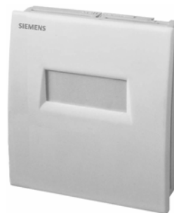
QPA20... Series Room Air Quality Sensor with Display.