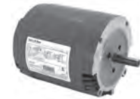
H1041L, H1046, H1046L, H1042L H1047L, H1043 H1043L, H1048L H1044, H1044L H1049, H1049V1