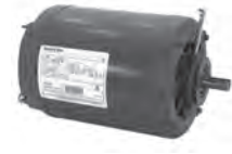
H982, H982V1 H983, H983V1 H984, H984L H985L, H946L H947L, H986, H986L H987, H987L

Applications: Replacement motor to be used on hot water pumps. For use with adjustable base.