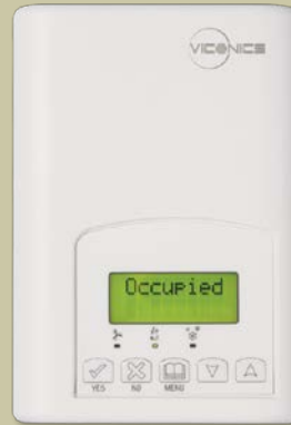
VZ7656 Central Controller

The VBZS offers unparalleled flexibility through the use of the open BACnet® communication protocol.