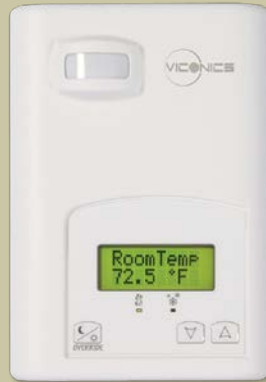
VZ7260 Zoning Controller with (PIR) Motion Sensor