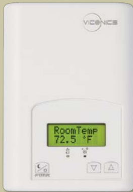
VZ7260 Zoning Controller