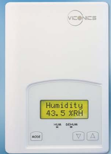
VH7200 Series Digital Humidistat