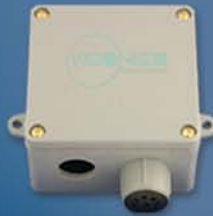
S2020E1000 Outdoor Sensor