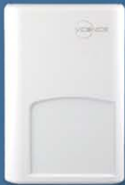
VH20 Wall Room Sensor