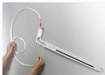
1227 Mounted in Incline Position