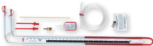
1227 Dual Range