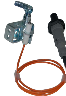
Q90 Series used with (Optional Piezo)