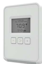
LCD with Buttons