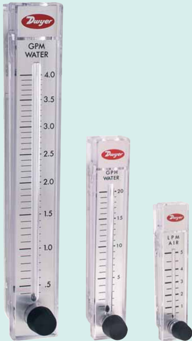
Model RMC-SSV 10" scale, 15-3/8" high